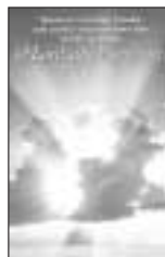
Abide with Me CI2-067030