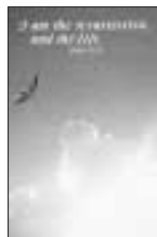
I Am the Resurrection CI2-042658

Regular Size Bulletins. 8½" x 11" (letter size). Shrinkwrapped in 50's. 50 for $4.50 ; 100 for $8.00 ; 500 for $36.00 ; 1000 for $64.00