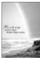
Wipe Every Tear CI2-076099