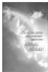
For All the Saints CI2-045304