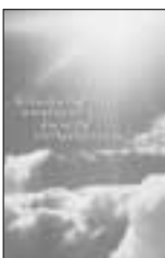
In God's Likeness CI2-066832

Regular Size Bulletins. 8½" x 11" (letter size). Shrinkwrapped in 50's. 50 for $4.50 ; 100 for $8.00 ; 500 for $36.00 ; 1000 for $64.00